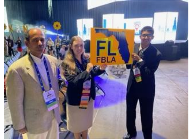
National Leadership Conference-Chicago