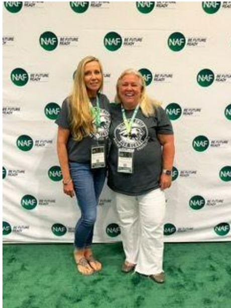
NAF Conference - Dallas