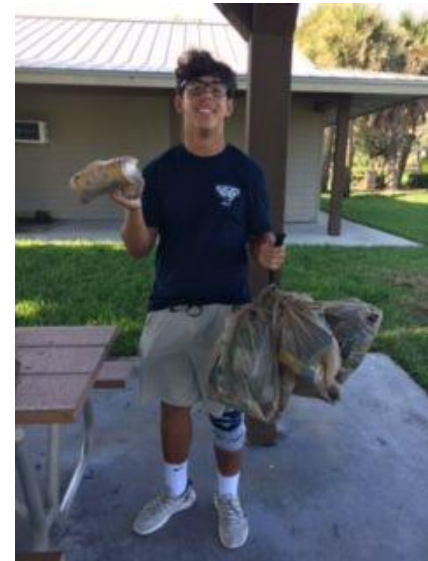
Young Friends of Jupiter Beach - Ocean Cay Park