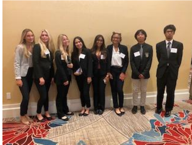
State Leadership Conference-Orlando