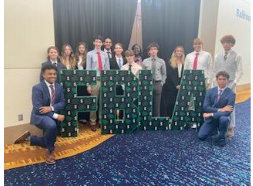
District Fall Rally 10/28/2022