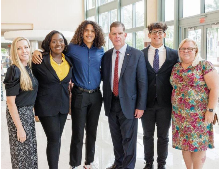
Forum Club Luncheon 10/17/2022 with U.S. Secretary of Labor, Martin Walsh